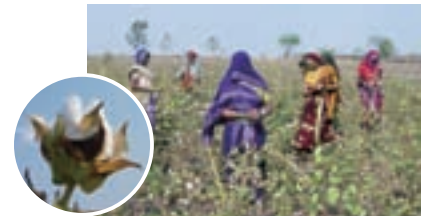
All organic cotton is handpicked.