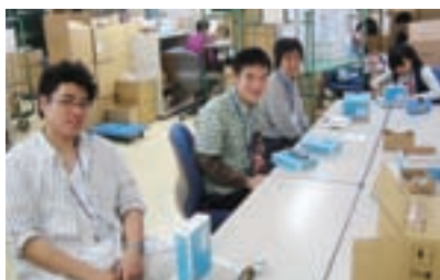
Working at ITCN Assist

In June 2007, ITC NETWORKS CORPORATION established ITCN Assist as a wholly owned subsidiary in order to create opportunities for the employment of the physically challenged. ITC NETWORKS CORPORATION consigns a portion of its distribution operations to the new subsidiary and has created an environment suited to individuals with disabilities by, for example, adopting employment regulations that make it easy for the physically challenged to work. Consequently, the subsidiary gained recognition as a special subsidiary as stipulated by the Law for Employment Promotion, etc. of the Disabled in October 2007. The subsidiary will fulfill its CSR by supporting the participation of the physically challenged in society.