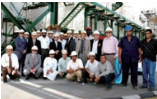
A ceremony marking the completion of renovation of a desalination plant at the Jeddah desalination plant in Jeddah

Over more than 30 years, we have delivered a large amount of on-land-use seawater desalination plant, primarily in the Middle East. In Saudi Arabia, we established a joint venture company with a major Saudi corporate group in 2002. Through that company, we are concentrating efforts on getting orders for new projects. Also, we further strengthened our businesses related to water resources by concluding a capital tie-up with Sasakura Engineering Co., Ltd., in February 2008.