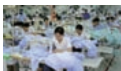
Sewing plant in Vietnam

In order to understand the actual situation of product procurement, we prepared a supply chain management survey sheet that included questions under 12 categories, such as compliance, protection of human rights, and environmental measures. Based on that survey sheet, we conducted a survey of the major overseas suppliers of our divisions. Salespeople in charge at Head Office actually visited overseas suppliers and conducted interviews with the managers of 16 companies. Aiming to achieve product procurement that reflects CSR, we will broaden the scope of these investigations in fiscal 2008.