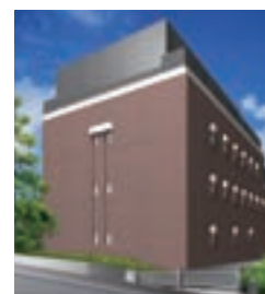
An image of CTC's new data center

ITOCHU Techno-Solutions Corporation (CTC) began construction of the Mejirozaka Data Center in Bunkyo-ku, Tokyo. We will create an environment-friendly, green data center by using a direct-current power source and incorporating a heat-venting system that fully exploits the building's characteristics and highly efficient air conditioners. CTC participates in Green Grid, an IT industry body established to improve the energy efficiency of data centers, and will continue to develop data center operations based on consideration for the environment.