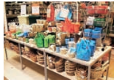
Some MOTTAINAI-brand products

MOTTAINAI official web site URL http://www.mottainai.info/english/