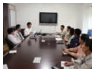
A CSR seminar at Dalian office

Manager, Human Resources/ General Affairs Section, ITOCHU Automobile Corporation