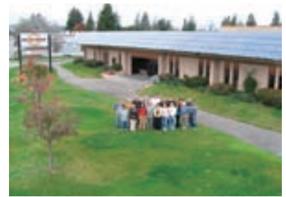
SOLAR DEPOT, INC.