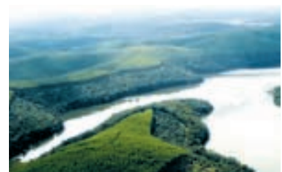
Celulose Nipo-Brasileira S.A. (CENIBRA) Plantation