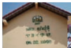
Yayoi School and its students

As part of its international contribution efforts, frozen food manufacturer Yayoi Foods Co., Ltd., donated the "Yayoi School" to the Kingdom of Cambodia. Yayoi Foods originally started as a provider of school meals. To give back to society, they donated the Contanan Elementary School building (known as Yayoi School), based on three key words, 1. school, 2. school meals, 3. children. The school was built on February 6, 2008, for children of Cambodia, who often do not receive adequate education nor nutrition. By also providing a destination for some of the school meals that Yayoi Foods distributes through the United Nations World Food Program, the school unites the three key words.