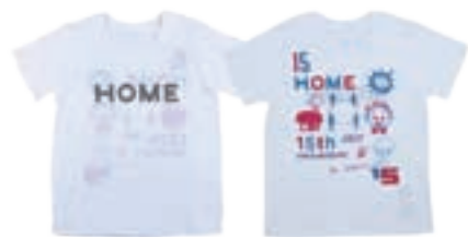
Mr. Children tour merchandise made from organic cotton