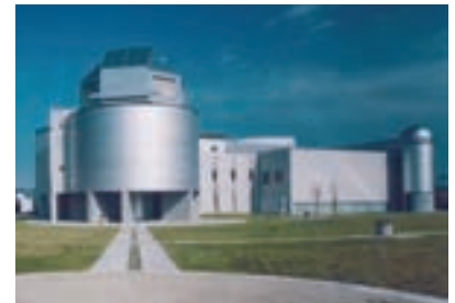
The new Sendai observatory