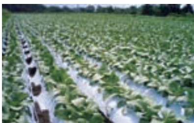
A bok choy Chinese cabbage field in an allied production region

company based on the ideal of helping revitalize and develop Japanese agriculture is attracting attention in the trading industry.