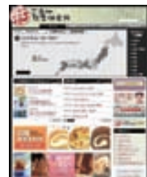
The Gourmet Search web site

Gourmet Search URL http://www.gotochi-soken.jp/ (Japanese only)