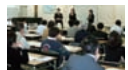
A lecture on communication with consumers

Because the Textile Company has businesses that are close to consumers, communication with customers and consumers is an important issue. In particular, group companies face that issue more often because they have more direct contact with consumers. Mindful of that, in February 2008 we invited lecturers from Watami Co., Ltd., and Wacoal Corp. to conduct lectures on responding to customers and consumers, mainly for group companies. Both from companies that emphasize communication with consumers and use it to achieve success in business, the lecturers gave talks that were extremely interesting and instructive for attendees.