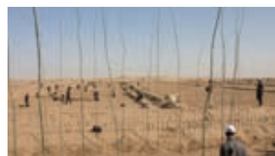
Desert greening project in Hsinchiang Uighur Autonomous Region

In partnership with a Japanese manufacturer and a local public research institution, ITOCHU CHEMICAL FRONTIER CORPORATION is conducting trials in the Hsinchiang Uighur Autonomous Region of China to ascertain the feasibility of a forestation businesses based on the use of an acrylic-acid-type water retention agent. In this large area, Hsinchiang Uighur is 1.65 million square kilometers, advancing desertification causes the yellow sand phenomenon that affects China, Japan, and South Korea and is becoming a worldwide environmental problem. In pursuing this project, our mission and our hope is to grow willows or other plants in the desert.