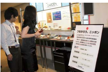
Steps taken at the employee cafeteria

Many farmers in the affected areas have had difficulty selling their produce. This is a direct result of many consumers avoiding all goods grown or reared in the prefectures close to the troubled Fukushima Daiichi Nuclear Power Plant. As a show of support, the Tokyo Headquarters has made a point of sourcing as much of the vegetables for the salads and side dishes offered at its cafeteria, from such producers as of April. The same is true for the liquor served by the cafeteria in the evenings. With roughly 1,600 employees patronizing the Tokyo headquarters establishment alone, we hope that this initiative will play a part, no matter how small, in helping local agriculture through this difficult time.