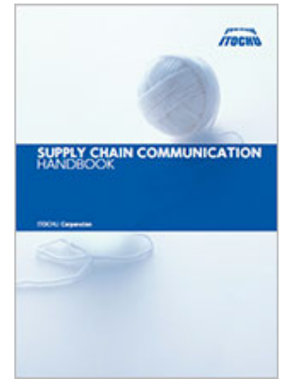
The Supply Chain Communication Handbook

In addition, we have also published a handbook on communications with suppliers, and use it to inform employees how to communicate with suppliers. Along with the handbook, we have set up a check system that will enable sales representatives and locally assigned ITOCHU employees to undertake more specific checks of the actual status of how key suppliers manage environmental issues, human rights, labor practices, the prevention of corruption, and other matters, and help them provide suppliers with advice on improvements. Moving forward, we will continue to conduct surveys and communicate with suppliers to raise employee awareness and enhance supplier understanding and implementation.