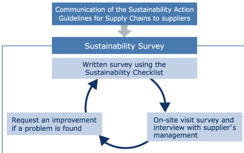
Conceptual rendering of the promotion of supply chain management

Starting from FY2009, in order to check the status of our various suppliers, each of the Division Companies and relevant Group companies of ITOCHU selects significant suppliers based on such parameters as high-risk countries, products handled and transaction amounts. Sales representatives of each Division Company or staff members of overseas subsidiaries and operating companies visit the suppliers and conduct the Sustainability survey by providing interviews or questionnaires (using the Sustainability Checklist) along with the mandatory questions on the seven core fields of ISO 26000.