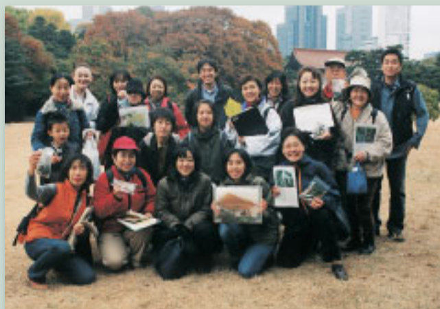
Employees' nature watching activity

Individual employees are exercising their volunteer spirit through "Fureai no Network," our employee volunteer organization. Activities include the holding of regular meetings for nature watching, disaster relief, and reading to the blind, monthly cleanups of the area around ITOCHU's Tokyo headquarters, participation in blood donation (over 1,500 donors to date), and bone marrow bank donor registration.