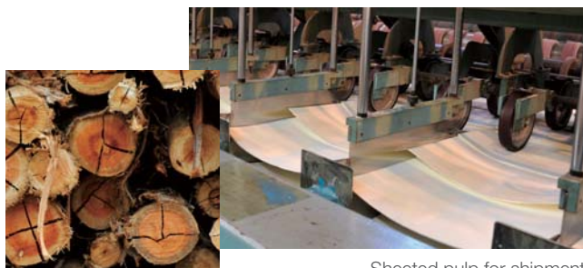
Logs of eucalyptus trees