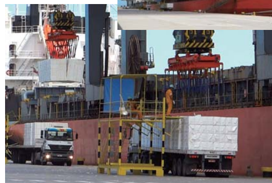
The pulp is loaded on a ship at a special port for export