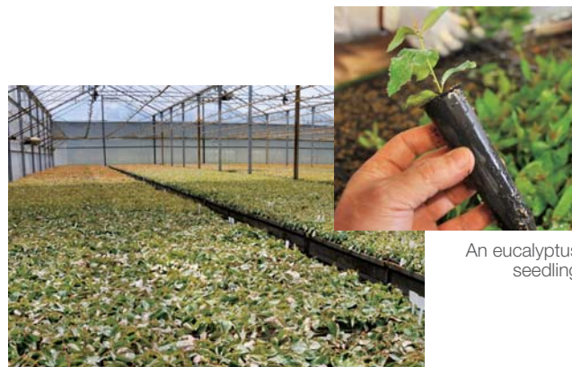
An eucalyptus seedling

In one day, 50,000 eucalyptus logs are fed into the production line. That means that large quantities of eucalyptus seedlings are necessary for planting, more than 50,000 a day, and CENIBRA uses its own nursery to produce 100% of the seedlings it needs. At the nursery, which is like a large test plantation, highly experienced Japanese specialists from Oji Paper, which is the lead shareholder, provide enthusiastic guidance about seedling development. To select rootstocks that are highly resistant to aridity, changes in temperature, insect pests, and wind; match the soil; and will grow well, 10,000 seed plants are created each year by crossbreeding rootstock (100 x 100). After trial planting, the best rootstocks are selected. The rootstocks selected in this way are known as clones, and the branches and leaves of the rootstocks (5 to 8 cm scions) are cut and placed in a small pot, in which they grow into 20 – 30 cm seedlings in 70 to 80 days. If all goes well, they are then sent on to the plantation site. At the nursery, 15 million seedlings are produced in a year. The cost competitiveness of pulp producers is said to be based on the growth of the eucalyptus trees, which are the raw material. CENIBRA continually repeats the process of seed improvement, patiently taking time and selecting the best seed plants. Outstanding cost competitiveness is maintained by painstakingly producing each individual seed stock in-house.