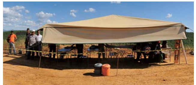
A tent where the workers can rest

Near the plantation and the harvesting area, there is a temporary tent that is used for the workers to take breaks and have lunch. I was surprised at the thorough approach to appropriate working conditions. The reason is that the industrial use of forest resources entails the strict observance of such things as conservation of the natural environment, maintenance of biodiversity, and contributions to the workers and the local community. We have reached an age in which the only companies that survive will be those that market products that have been “certified” as clearing a management process that meets these social requirements.