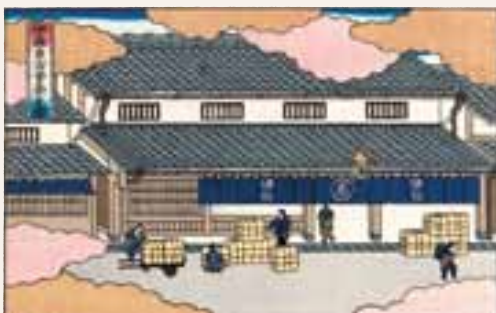
"Itoh Itomise" thread and yarn store at the time of its opening in 1893