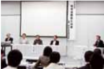
Scene of the public lecture titled "Global Warming and Japan"

ment of Hokkaido, organized a public lecture under the title "Global Warming and Japan" in collaboration with the government of Hokkaido, the University of Tokyo and Hokkaido University.