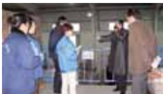
Scene at a fact-finding investigation of a group company

We believe that the activities of one group company can impact the entire group, and thus, we conduct fact-finding investigations at about 20 group companies a year, since 2001 also including overseas group companies, in order to prevent environmental risks of the entire group in advance. Global Environment Office visits the group companies, conducts interviews of the senior management and staff at each company, inspects the factory, warehouses and other facilities and then asks questions to find out the status in the compliance with applicable environment-related laws, the management of waste, the use of energy, environmental education and others in order to strengthen the environmental management organization.