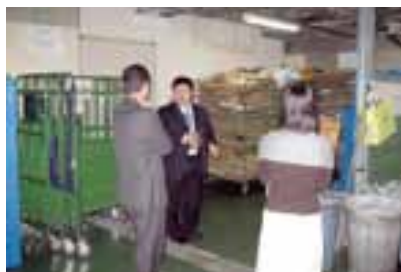
Inspection of a storage point for waste in the basement of our Tokyo headquarters

In addition, they call upon their colleagues at their division to promote energy conservation and recycling of waste also in their daily office work.