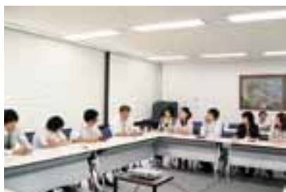
Scene of an eco-leader conference

The environmental managers are responsible for the environment-conserving activities in their respective divisions, and promote these activities together with the eco-leaders. They cooperate with the Global Environment Office to respond to the applicable environmental laws and regulations for the business activities of their division, to perform environmental risk assessment of the products handled, and to assess the environmental impact