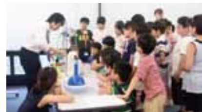
Scene at an experiment on the rising sea levels due to global warming

Since 1992, we have been organizing "Summer School Programs on the Environment" mainly targeting elementary school students of Minato ward, Tokyo. Following fiscal 2007, about 90 elementary school students participated in our two-day global environment program in fiscal 2008, where they, together with volunteers including our employees, learned in hands-on lessons by weather forecasters about global warming and in explorations of the nature around the Headquarters guided by nature observation instructors in a very lively class.