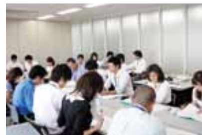
Training of in-house environmental auditors at the Tokyo headquarters. The attendants are performing a role play simulating an audit

applicable environment-related laws and regulations for the business activities of the respective divisions, environmental education, energy conservation and waste-recycling initiatives at the office, and others.