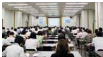
Scene at a seminar