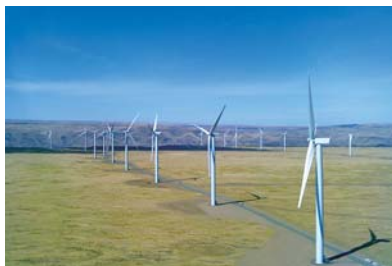
Shepherds Flat wind farm

The project is the second project implemented under a memorandum on business collaboration concerning co-investment in renewable energy worldwide, concluded between ITOCHU and the General Electric Company.