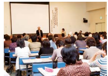
A training session for healthcare workers on measures for preventing infections

We create "products and services," "information," and "operational knowhow" by combining and merging the functions of member companies of Japan Medical Partners. By providing them, we spread the correct knowledge about disasters daily, help take related initiatives, and help ensure the continued provision of medical services in the event of disaster.