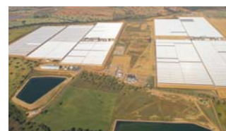
Two concentrating solar thermal power plants jointly operated with Abengoa Solar

* A system for purchasing electricity at preferential rates designed to promote the use of renewable energy sources