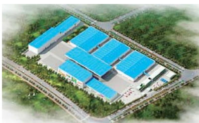
Rendering of the completed facility

Dalian New Green, as the only recycling facility licensed by the Chinese Government at Dalian Changxing Island Harbor Industrial Zone, is planning to install cutting-edge equipment and sophisticated Japanese environmental technology to further improve operations. The aim is to set this facility apart as a model for all integrated recycling centers built in China in the future.