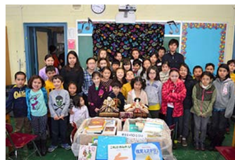
Students at Japanese Language School of Greater Hartford

The foundation engages in activities for contributing to the healthy growth of children, such as two current major projects: subsidizing development of children's literature collections (including subsidies for library development at schools and supplementary schools for Japanese nationals overseas), and promoting development of an e-book library.