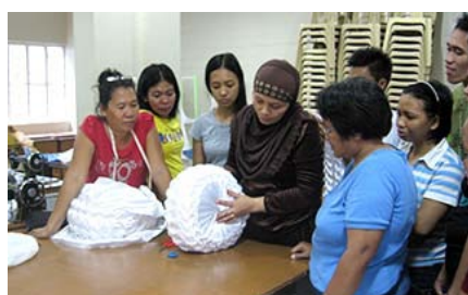
Vocational training of making handicrafts