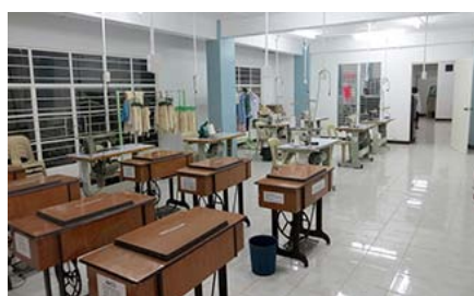
The renovated basement room of sewing machines