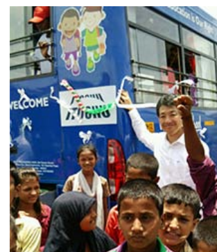
Children gathered for the opening ceremony