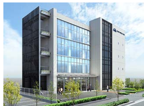
Image of completed ITOCHU Medical Plaza

To the Foundation for Kobe International Medical Alliance, we donated 500 million yen necessary for constructing the ITOCHU Medical Plaza, a facility aimed at conducting international medical exchange. The Plaza is planned to open in October 2014 in the Kobe Medical Industrial City, one of the largest medical clusters in Japan. There is great expectation locally and internationally for the development of the center for human resource development, including education and technical training of overseas physicians and healthcare practitioners mainly from Southeast Asia, projects for accepting trainees from overseas, and a variety of research projects such as joint development of medical equipment with universities and other institutions.