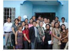
Together with the staff members of KnK

At the House for Youth, we help young people living in slums get jobs by providing them with training courses in computer skills and sewing. We have also started activities for creating income in the slums mainly through handicrafts. Through this work, young people can, for instance, create and sell accessories to help them become financially independent.