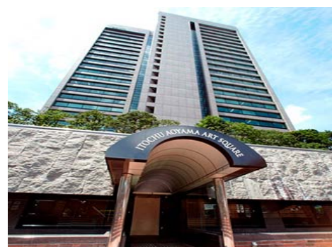
ART SQUARE facade

ITOCHU will continue to address a range of social issues through art and regularly present exhibitions to contribute to creation of the culture of life in local communities.