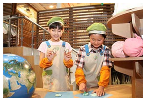
Children making soap from recycled materials

At KidZania Tokyo, a popular venue for children, we will continue to provide them with opportunities to enjoy learning environmental preservation from a global perspective, helping to develop young people who will be leaders of sustainable society.