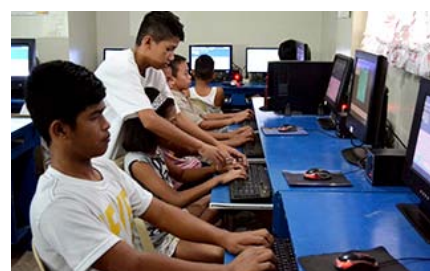
Vocational training of using PC