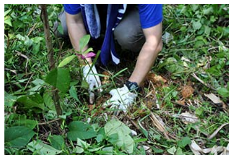
Planting of tree saplings

We also organize a tour to the island every year comprised of volunteers from among ITOCHU Group employees. In these tours, the employees take part in reforestation efforts (including tree planting and cutting grass), observing wild animals, and other activities.