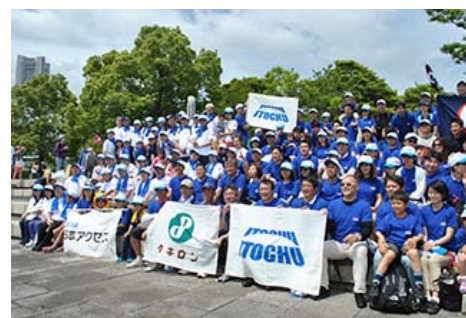
Participated in End Hunger: Walk the World

In May 2014, 270 employees of ITOCHU Corporation and ITOCHU Group companies participated in End Hunger: Walk the World, held in Yokohama. This is an annual event to raise money and awareness for the WFP's efforts to fight child hunger and malnutrition. At its Tokyo Headquarters as well, ITOCHU regularly engages in activities such as fundraising and holding panel exhibitions for introducing the WFP's activities.