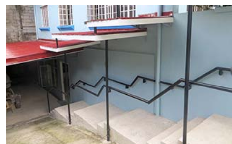
Exterior steps of the House for Youth after renovation

In December 2009, ITOCHU provided support for renovation of the House for Youth, a home that helps young people become independent, located on the outskirts of Manila. Support was provided via Kokkyo naki Kodomotachi (KnK: meaning "children without borders"), an authorized Japanese NPO that supports street children, children who are victims of major disasters, and other children in developing countries. House for Youth was again renovated in 2012 into a job training facility that helps children achieve independence. In November 2013, the underground floor and the roof of the house were renovated, enabling the facility to provide more job training courses, which allows more young people to acquire practical skills. The facility currently provides a wide range of support to approximately 1,000 young people every year.