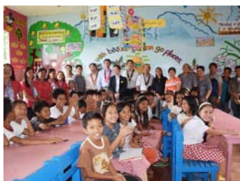
An elementary school to which we donated educational materials

We employ a large number of people on farms and in factories, and promote business activities with many people, including those from local governments and companies. A harmonious coexistence with the local communities is therefore an extremely important factor for us. In the areas around our farms, we have engaged in activities such as the provision of tanks for water for domestic use and the provision of chairs and educational materials including textbooks to around 50 elementary schools.