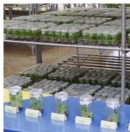
Grown in flasks for seven months