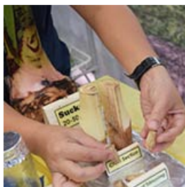
Growth point of a pup