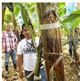
Adhesive tape for catching bugs