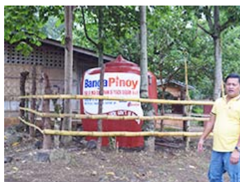
By 2014, we donated 173 water tanks (each tank benefits about 60 households) of this type to local residents.