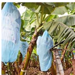
Bags for preventing diseases, harmful insects, and damage from birds, and for heat retention

On the farm, banana seedlings are planted manually, one by one. They thrive in the sunlight and the stems, which have about 200 bananas each, keep growing until they are harvested about one year later. (The number of bananas and the growing period differ according to the variety, altitude and other factors.) During the growing period, farmers cover the bananas with bags to protect them from harmful insects and place cushioning materials into each individual bunch to prevent scratches. These and other care tasks are all undertaken manually. At the time of harvest, new bulbs emerge around the base. Several generations of bananas are harvested in this way.