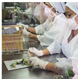
Division of incubated tissues