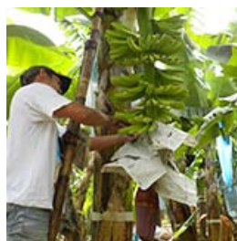
Sheets for preventing scratches