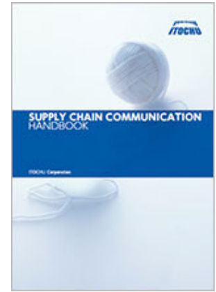
The Supply Chain Communication Handbook

In addition, we have also published a handbook on communications with suppliers, and use it to inform employees how to communicate with suppliers. Along with the handbook, we have set up a check system that will enable sales representatives and locally assigned ITOCHU employees to undertake more specific checks of the actual status of how key suppliers manage environmental issues, human rights, labor practices, the prevention of corruption, and other matters, and help them provide suppliers with advice on improvements. Moving forward, we will continue to conduct surveys and communicate with suppliers to raise employee awareness and enhance supplier understanding and implementation.