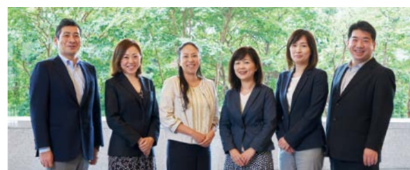
IR Department members (July 2018)