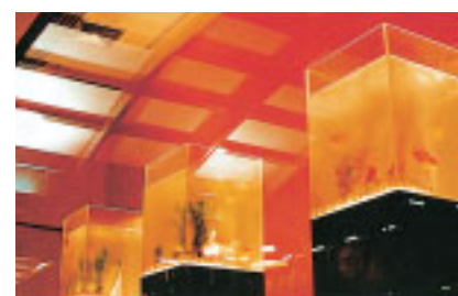
Aquarium display using acrylic sheet

We also plan to add capacity to compound manufacturer Hexa Color (Thailand) Ltd. and polypropylene film manufacturer Shanghai Jinpu Plastic Packaging Material Co., Ltd. (China) as we respond to the growth in demand for synthetic resins in Asia.