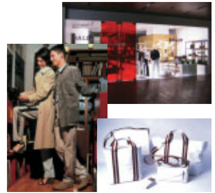
POLLINI 2003 Spring/Summer collection (The left) BALLY 2003 Spring/Summer collection (Two on the right)

In March 2003, we signed an exclusive import and sales contract with Pollini S.p.A., a total fashion brand based in Italy. With a history of more than 100 years, the company's main products are shoes of the highest craftsmanship. In addition to ladies' and men's shoes, we plan to comprehensively develop bags, leather accessories and wear and to cultivate sales routes with department stores in order to achieve sales of ¥3.0 billion in three years' time.