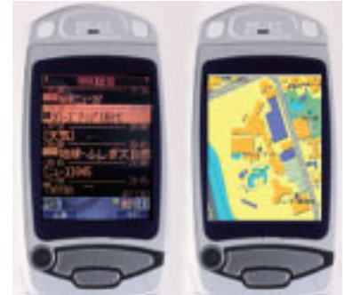
Electronic Program Guide (left) and location and map information (right)

Along with enhanced functions of mobile phones and development of Internet home appliances, NANO Media, Inc. aims to become the top firm in the mobile internet content distribution and service provision area not only by providing content for mobile phone and other personal media, but by providing machine communication services such as the remote control of home appliances and services linked to other media.