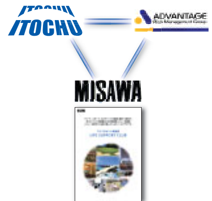
The tie-up with Misawa Resort and Advantage Risk Management Group

Its core feature is its program for guaranteeing income to employees who take an extended amount of time off due to illness or injury. Advantage Risk Management Group, which jointly offers the service, boasts a dominant 30% share of the domestic market currently estimated at approximately ¥5.0 billion. We are committed to this service as a core business in our retail strategy.