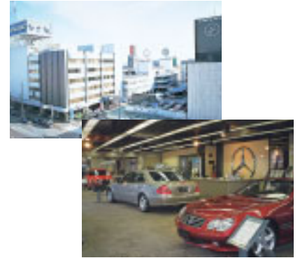
Head office of Yanase and its Showroom

ITOCHU and Yanase will share and reinforce each other's know-how in procurement, retailing, and marketing. This will in turn enable ITOCHU to take advantage of Yanase's valuable customer base and maximize profit opportunities in all aspects of the automotive-related business including the sale of used-cars, parts and accessories, and automobile financing.