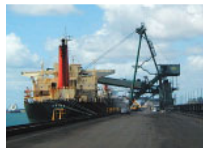
Coal loading port

We have decided to participate in the Ashton Project for developing new coal resources in New South Wales, Australia. We control a 20% interest in this project. Ashton is being developed as an open-pit coal mine with annual production of 2 million tons, which is expected to be expanded to 4 million tons by developing underground mining. From fiscal 2004, the coal produced by this mine will be sold in Asia including Japan, Europe, and the U.S. as semi coking coal for coke production and as thermal coal for power generation. We are in charge of marketing for this project and are actively promoting sales on a global basis.