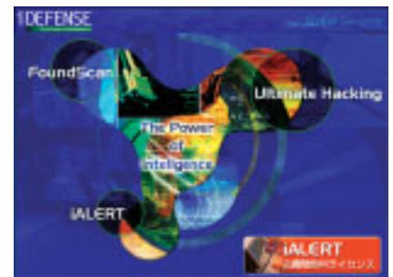
iDEFENSE Japan Inc.'s cyber security information services

Intrusion detection software is presently not effective enough against increasingly-sophisticated cyber attacks. For this reason, iDEFENSE Japan Inc., in alliance with U.S.-based iDEFENSE Inc. and Foundstone Inc., provides the latest cyber threat intelligence information in Japanese language near real time. As a part of comprehensive cyber security intelligence information services, the company offers the most advanced vulnerability assessment and management system along with security training and consulting services which enable customers to protect their valuable assets from cyber threat.