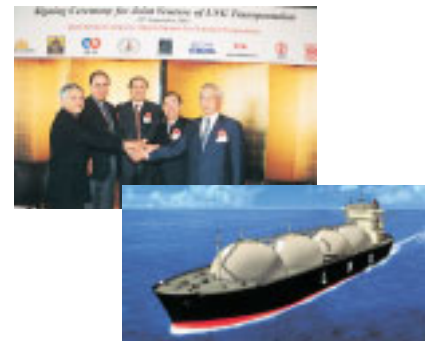
Signing ceremony for a joint venture of LNG transportation and 145,000cbm LNG carrier

LNG is increasingly recognized as a clean energy source. We will further develop LNG related businesses and enhance our presence in its transportation field.