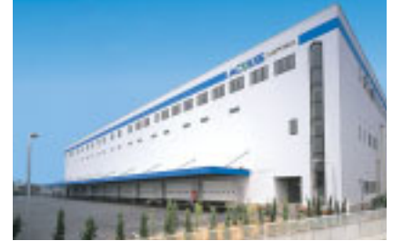
YUKIJIRUSHI ACCESS' multi-temperature distribution center

By strengthening its ties with YUKIJIRUSHI ACCESS, which has a “nation-wide distribution network” and “multi-temperature distribution,” the ITOCHU Group will be able to build the nation-wide, multi-temperature distribution network that is absolutely essential to its SIS strategy. Particularly strong in chilled and frozen food distribution, YUKIJIRUSHI ACCESS will play a major role in the ITOCHU Group’s full-scale entry into the chilled and frozen food distribution market, whose estimated worth is ¥10 trillion.