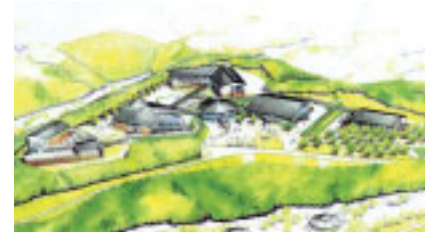
Completion drawing of “Chiba City Nature House for Youth”

In addition to organizing the overall scheme of the PFI as representative of the corporate consortium and project manager, ITOCHU will raise the funds for the project. We will also take advantage of the ITOCHU Group’s integration, by putting ITOCHU Urban Community Ltd. in charge of maintaining the facility.