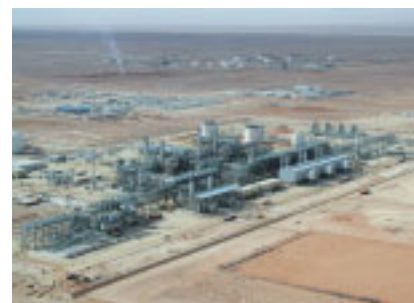
Gas production facility

The Ohanet Project in Algeria, in which ITOCHU Oil Exploration Co., Ltd. is participating through Japan Ohanet Oil and Gas Co., Ltd., has entered the final stage of construction for fiscal 2004 production start. Planned production is for 3 trillion cubic feet of natural gas, 9 million tons of LPG, and 11 million tons of condensate. As the largest private sector investment in Algeria by a Japanese corporation to date, this project will cost about US$1.0 billion in total and is being cooperatively financed by JBIC (Japan Bank for International Cooperation) and Japanese commercial banks. ITOCHU Oil Exploration Co., Ltd. has a 35% equity stake in the Japanese consortium Japan Ohanet Oil and Gas Co., Ltd., which has a 30% interest in this project.