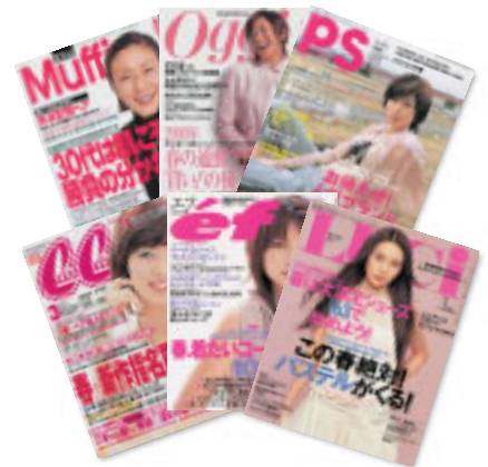
MAGASseek collaborates with these fashion magazines.

Launched in August 2000, the MAGASseek site has grown to have tie-ups with five major publishers and handles some 120 brands that are featured in women's magazines. With sales of ¥700 million and 10 million hits per month, the site has won the strong support of consumers who "can order popular products whenever and wherever they wish." It has also been well received by the apparel industry as the "fastest means of collecting sales data." With the new company, we plan to expand the availability of equipment and models for this service, develop overseas business, and promote the growth in business with major apparel makers.