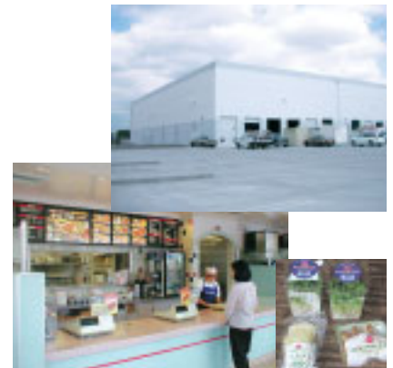
ICREST's new warehouse (upper), YOSHINOYA WEST store (lower left), and JCP's private brand products (lower right)

This acquisition will not only strengthen ITOCHU’s food distribution business on the U.S. West Coast through the addition of JCP’s sales network, but will also support the comprehensive development of our food businesses in the U.S. through its positive impact on the growth strategy of YOSHINOYA WEST, INC., a subsidiary of Yoshinoya D&C Co. Ltd.