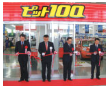
Opening "Pit 100 Fujioka"

Overseas, we will reinforce our tire retail business in Japan, North America, and Europe by developing our franchisee network and by acquiring distributors through our subsidiaries, such as Am-Pac Tire Distributors in North America and Stapleton's (Tyre Services) in Europe.