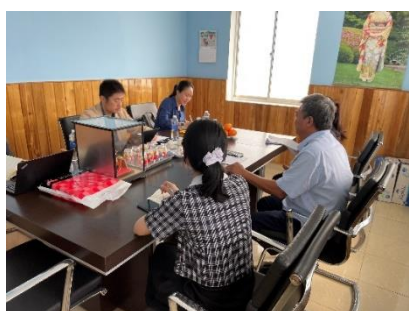
(Left) Management Interview