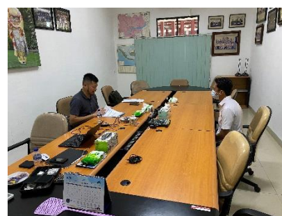
(Right) Employee interview