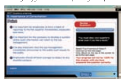
English version of an e-learning course on the importance of making suggestions and reporting to superiors

We conducted compliance seminars for each region. Among those, members of the Headquarters Compliance Office visited cities in Asia and the Middle East—Beijing, Quingdao, Hong Kong, Hanoi, Ho Chi Minh, Bangkok, Jakarta, and Dubai—to conduct education and training. Further, at the same time the national staff of all overseas offices and all employees of ITOCHU Corporation Headquarters took e-learning courses, studying important issues, including the danger of dependence on industrial customs and existing practices and the importance of making suggestions and reporting to superiors.