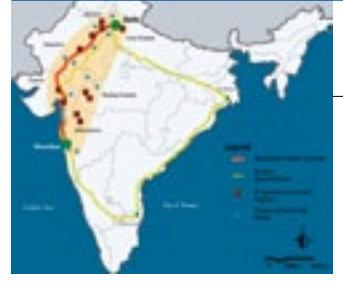
Freight railway route and development