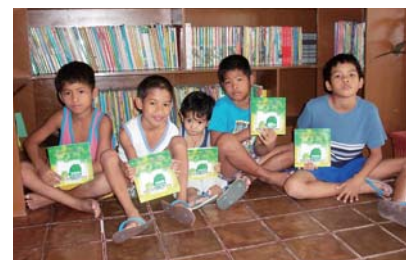
Children using the facility

We support the activities of “Kokkyo naki Kodomotachi” (KnK: meaning Children without Borders), an NGO that supports street children, children who are victims of major disasters, and other children in developing countries. On December 11, 2009, renovations were completed for House for Youth, made possible through support from ITOCHU. Located in the outskirts of Manila (Philippines), House for Youth is a home that helps young people become independent. Moving forward, the home provides a wide range of support to approximately 1,000 young people per year.