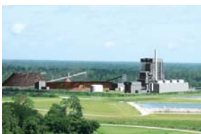
Biomass Power Generation Plant

ITOCHU will develop, invest in and operate a biomass power project in northern Florida through Tyr Energy, a U.S. independent power producer. The power plant will be the largest biomass power project in the U.S., with a generating capacity of 100 megawatts, and will be fueled by wood chips and tree thinnings. After going into commercial operation in 2013 the project will supply power to approximately 70,000 households based on a 30-year power supply agreement with the power utility in Gainesville, Florida. Operations and maintenance will be performed by NAES, a wholly owned subsidiary of ITOCHU and one of the world's largest operation and maintenance service companies. We intend to actively develop and promote renewable energies through project initiatives.