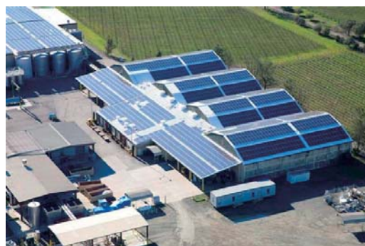
Example of past SolarNet projects: Beringer Vineyards, California