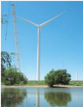
Keenan II wind farm

The total power capacity of the Keenan II wind farm in the U.S. state of Oklahoma, which ITOCHU invested in with GE in October 2010, is 152 megawatts (66 2.3-megawatt wind turbines). A 20-year power purchase agreement has been signed with Oklahoma Gas & Electric Company, and power will be supplied to approximately 45,000 households in Oklahoma. The project is expected to reduce greenhouse gas emissions by roughly 413,000 tons annually. Commercial operation commenced in December 2010. The wind farm's operations and maintenance is handled by NAES Corporation, a wholly owned subsidiary of ITOCHU and one of the world's major power plant operation and maintenance service companies.