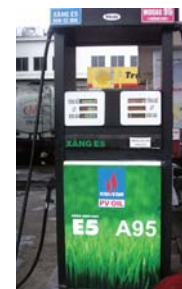
Gas station selling ethanol-gasoline blends

ITOCHU is taking part in a fuel bioethanol production project in Binh Phuoc Province, Vietnam in partnership with Petrovietnam Oil Corporation of the Petrovietnam Group, Vietnam's national oil and gas company. Commercial production of bioethanol from cassava, which is cultivated extensively in Vietnam, is slated to commence in the spring of 2012 with targeted output of approximately 100,000 kiloliters annually. Bioethanol produced by the project is expected to be distributed to the market through gas stations affiliated with Petrovietnam Oil. Vietnam is expected to promote the production and supply of ethanol-gasoline blends going forward as a domestically produced alternative to gasoline.