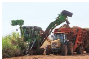
Sugarcane being harvested

ITOCHU has been developing production and sales projects for bioethanol and sugar made from sugarcane with Bunge, a major U.S. agribusiness firm, in the Brazilian states of Minas Gerais and Tocantins since 2008. Plans call for expanding the total ethanol production capacity of both projects to approximately 500,000 kiloliters. The ethanol will be sold domestically in Brazil but also exported to North America, Europe and Japan. In addition, bagasse, fibrous matter that remains after the sugarcane is crushed, is effectively utilized as fuel for onsite power generators, with any surplus power sold in the country. Brazil is a major bioethanol producer, accounting for approximately 30% of the global market, and is working to provide stable supplies of highly cost competitive bioethanol.