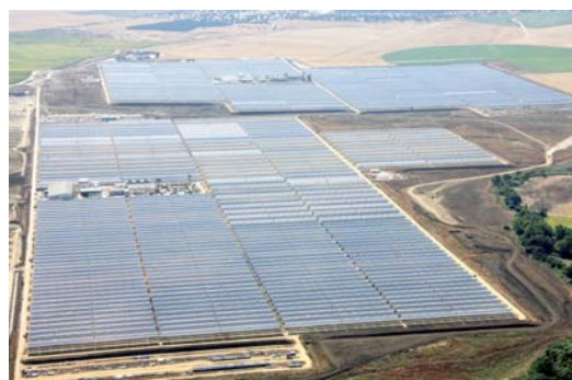
Similar solar thermal power plant also operated by Abengoa