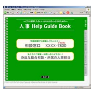
The "HR Help Guide Book" posted on the intranet

ITOCHU has set up an employee consultation desk to allow employees to discuss problems they may be individually confronting. A "HR Help Guide Book" has also been posted to the ITOCHU intranet, and efforts to broadly raise employee awareness of the consultation desk are made as part of a structure that allows employees to consult on issues of concern. An external Hotline System staffed by independent counselors has also been established.