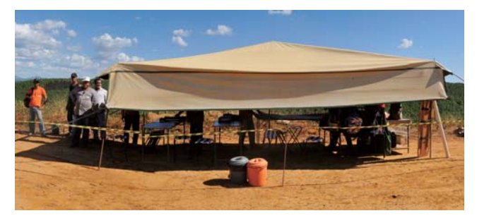
A tent where the workers can rest

Near the plantation and the harvesting area, there is a temporary tent that is used for the workers to take breaks and have lunch. I was surprised at the thorough approach to appropriate working conditions. The reason is that the industrial use of forest resources entails the strict observance of such things as conservation of the natural environment, maintenance of biodiversity, and contributions to the workers and the local community. We have reached an age in which the only companies that survive will be those that market products that have been "certified" as clearing a management process that meets these social requirements.