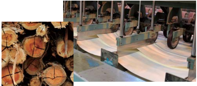
Logs of eucalyptus trees