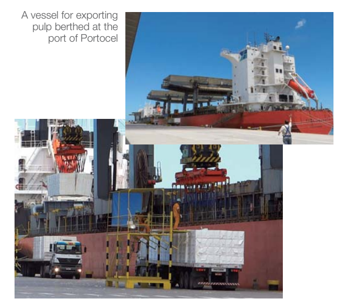
The pulp is loaded on a ship at a special port for export

Portocel (full company name Terminal Especializado de Barra do Riacho S.A.) is owned 49% by CENIBRA and 51% by Fibria S.A. (Brazilian pulp maker). The world's largest specialized pulp terminal, it exported 5.5 million tons of pulp in 2011. Brazil is in the process of establishing its infrastructure. In this setting, the fact that CENIBRA had, in advance, secured a rail transport route from the mill to a port, and owned a shipping port, was one of the sources of CENIBRA's cost competitiveness.