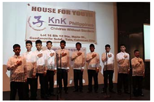
Children from the House of Youth participating in the 100th anniversary celebration of ITOCHU Corporation's Manila branch