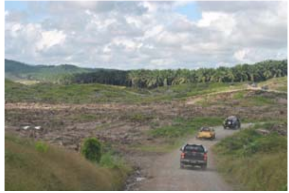
Transferring to 4WD jeeps to travel to the treeplanting site