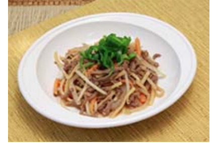
No.2: Bulgogi full of vegetables 597kcal