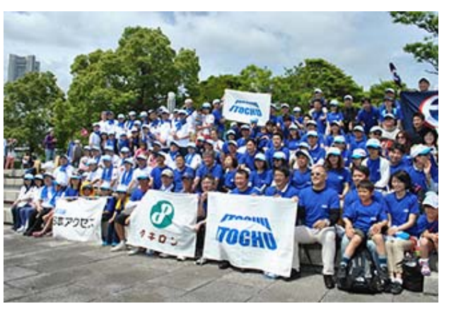
Participated in End Hunger: Walk the World

On December 5 and 6, we solicited donations to the UN World Food Program (WFP) in the reception area on the 1st basement floor of the Tokyo Headquarters and collected a total of 365,261 yen. At the venue, panels showing WFP's activities were displayed, and a limited number of special Santa Claus dolls were given to donators on a first-come and first-served basis. The money donated by the large number of ITOCHU