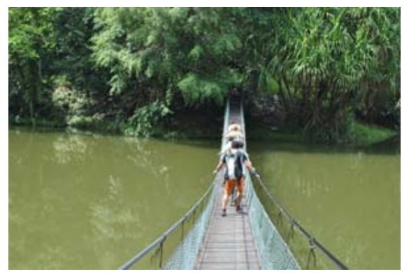
The Centre, which grows tropical plants and birds, can be visited on foot.