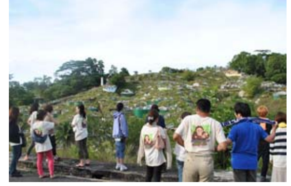
On the way to the airport, we stopped off at the Sandakan cemetery. In a small corner, down a narrow path at the rear, there is a famous Japanese cemetery. (The photo shows the Chinese cemetery.)