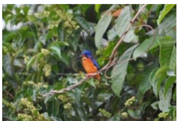
Captivating colors of the kingfisher