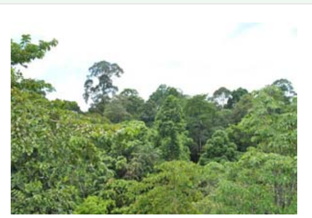
The protected area retains the look of virgin rain forest with many species of trees growing close together in a rich ecosystem.