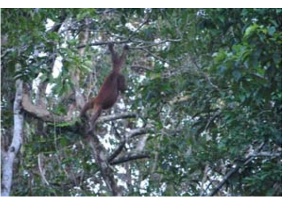
Finally we came across a wild orangutan!!