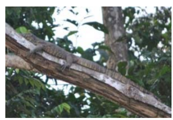
A monitor lizard clinging to a tree (about 1 m long)