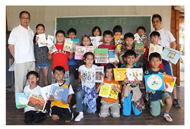
Students at a Japanese school in Guatemala

Please refer to the page 69 for the 100 Children's Books aid that we conduct together with our shareholders.