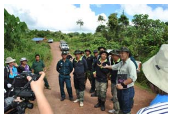
Explanations at the tree-planting site