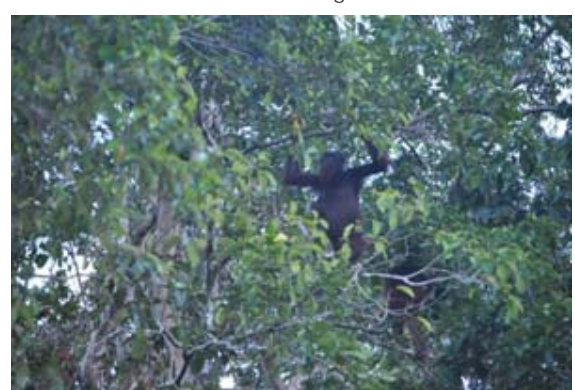
After a short while we encountered 2 more wild orangutans!! They were only 50-60 meters away from the boat.