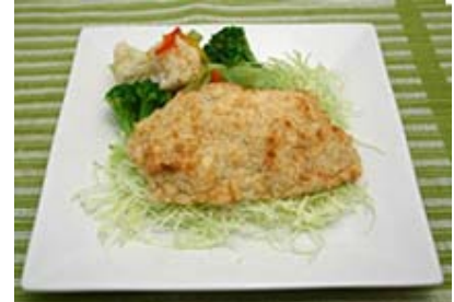
No.3: Non-fried white meat Mayo cutlet 500kcal