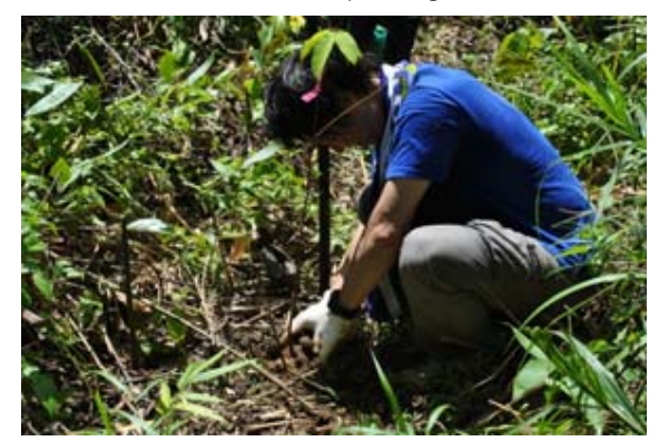
Pouring with sweat and venturing into deep country while keeping to the tree-planting line

After finishing the tree-planting, we went by bus back to the hotel. The people participating in the evening cruise from the hotel in Sukau encountered proboscis monkeys, orangutans, lizards, kingfishers and other wild animals. After the evening meal, there was also a night cruise. The species of animals you can observe changes between dusk and nighttime. We traveled downstream at night through a magical landscape that took our breath away as we enjoyed the scenery under a starry sky.