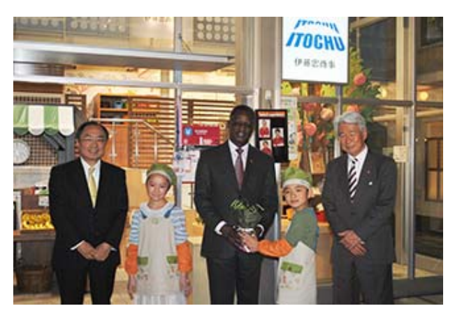
Ceremony for presenting tree saplings to Kenya

We have also introduced a program in which, for each child creating an original item at the Eco Shop, an amount