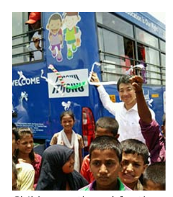
Children gathered for the opening ceremony