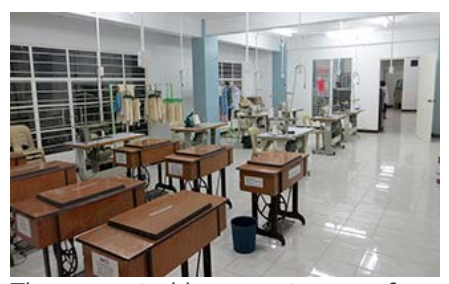
The renovated basement room of sewing machines