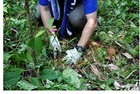
Planting of tree saplings

In northeast Borneo, at North Ulu Segama in the state of Sabah in Malaysia, where ITOCHU supports an area for rainforest regeneration,