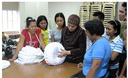
Vocational training of making handicrafts