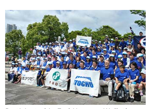
Participated in End Hunger: Walk the World

With the hope of alleviating hunger and poverty worldwide, we have been serving as a council member of the Japan Association for the WFP, a nonprofit organization that focuses on building support in Japan for the World Food Programme (WFP) and its hunger relief operations. In May 2014, 270 employees of ITOCHU Corporation and ITOCHU Group companies participated in End Hunger: Walk the World, held in Yokohama. This is an annual event to raise money and awareness for the WFP's efforts to fight child hunger and malnutrition. At its Tokyo Headquarters as well, ITOCHU regularly engages in activities such as fundraising and holding panel exhibitions for introducing the WFP's activities.