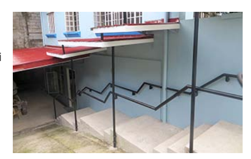
Exterior steps of the House for Youth after renovation

In December 2009, ITOCHU provided support for renovation of the House for Youth, a home that helps young people become independent, located on the outskirts of Manila. Support was provided via Kokkyo naki Kodomotachi (KnK: meaning "children without borders"), an authorized Japanese NPO that supports street children, children who are victims of major disasters, and other children in developing countries. House for Youth was again renovated in 2012 into a job training facility that helps children achieve independence. In November 2013, the underground floor and the roof of the house were renovated, enabling the facility to provide more job training courses, which allows more young people to acquire practical skills. The facility currently provides a wide range of support to approximately 1,000 young people every year.