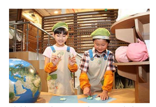
Children making soap from recycled materials

At KidZania Tokyo, a popular venue for children, we will continue to provide them with opportunities to enjoy learning environmental