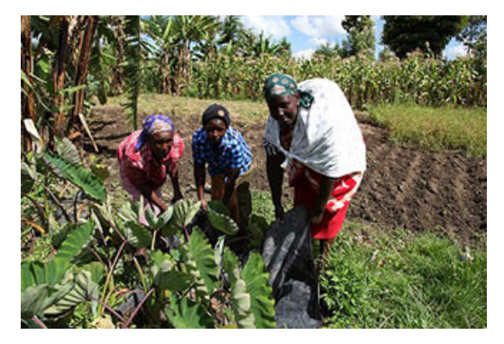
Tree-planting activities in Kenya