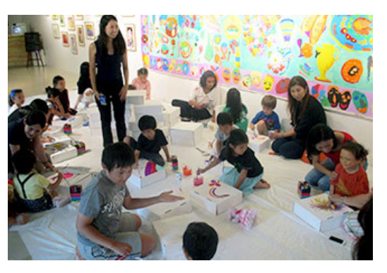
HAPPY BIRTHDAY EARTH - Change the World with Children's Art -Workshop entitled "Let's paint picture on white cloth together!"