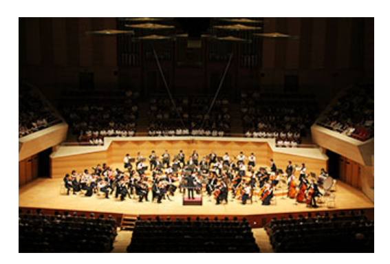
The first performance at Suntory Hall