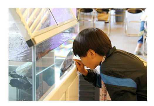
Up-close observation of the sea turtle

To build a more sustainable society, it is important that each one of us should try to live an eco-friendly lifestyle. From such a viewpoint, every summer since 1992, ITOCHU Corporation has been holding a summer school program on the environment for local children and employees' families as a means of raising awareness of environmental issues. To date, we have provided a cumulative total of more than 1,200 elementary school children with opportunities to learn about environmental and biodiversity conservation.