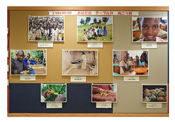
Limited time menu for "Takata no Yume wo Tabete Todokeru (Delivering Aid by Eating Takata no Yume)! TFT World Food Day Campaign" and photographs of children supported by the TFT program displayed in the cafeteria