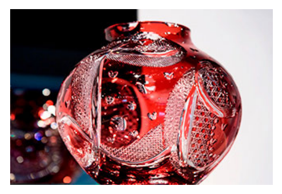
The Works of 10 Young Edokiriko Artisans -Glass and Kiriko