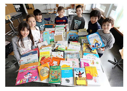
A Japanese school in Zug, Switzerland, which was granted book subsidies

* Please refer to P121 for supporting ten schools in the areas affected by the Great East Japan Earthquake through the 100 Children's Books Grant Conducted with Shareholders.