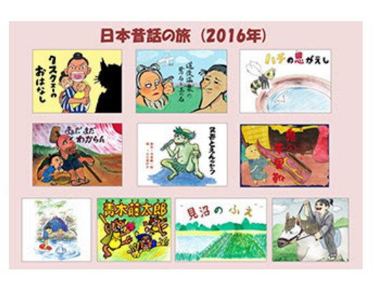
The ten folk tales that were digitalized in FY2017