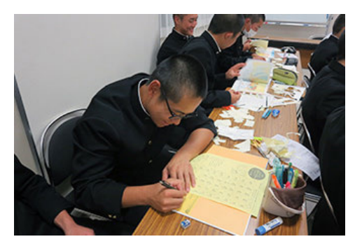
Students of Ofunato High School affixed labels showing text translated into local languages.

Shanti Volunteer Association engages in activities of sending Japanese picture books to children in Southeast Asia, by affixing labels showing text translated into local languages on the picture books. Every week, employee volunteers of ITOCHU affix the labels on the picture books together with the ITOCHU Foundation by using a dedicated kit purchased from Shanti Volunteer Association. Since FY2015, these activities have been expanded to children in areas affected by the Great East Japan Earthquake. In FY2017, a total of 462 people took part in these activities at 16 locations including family libraries, libraries, and elementary, junior high, and high schools in Fukushima, Iwate, and Miyagi Prefectures with the support of seven organizations promoting children's book reading locally.