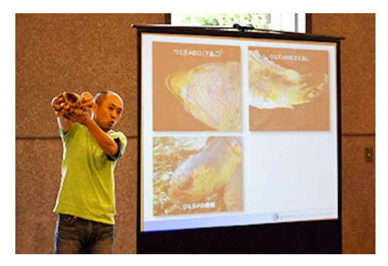
A lecture being given during the summer school program on the environment