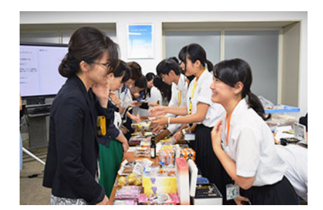
Students of Hachiman Commercial High School explaining the attractiveness of local specialties from various parts of Japan, which they purchased on their own