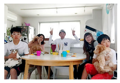
A university student from China (second from the right) and her host family

Since its inception, ITOCHU Corporation has supported the "Visit Japanese Enterprises and Feel Japan" program organized by the Japanese Chamber of Commerce and Industry in China to give Chinese university students the opportunity to learn more about Japan. The program aims to promote friendship between Japan and China by having university students from China visit Japan twice a year and engage in citizen-based exchanges. In FY2017, the 18th in May and 19th in December, iterations of the program were run, with three employees from the ITOCHU Group accepting Chinese university students as hosts and enjoying citizen-based exchanges with their families.