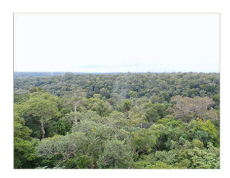
The Amazon rainforest is the largest in the world and is said to supply one-third of all the oxygen on earth

Concerning the support for the construction of the Field Station, a research facility, ITOCHU donated funds for the construction and development of a facility (visitor center), including a cafeteria and an exhibition hall where visitors can gather. Through these initiatives, ITOCHU will provide opportunities to experience a wide variety of plants and animals in the rich natural environment of the Amazon rainforests, contributing to the environmental education of both local residents and tourists. This is JICA's first industry-government-academia collaboration for conserving the Amazon's ecosystem.