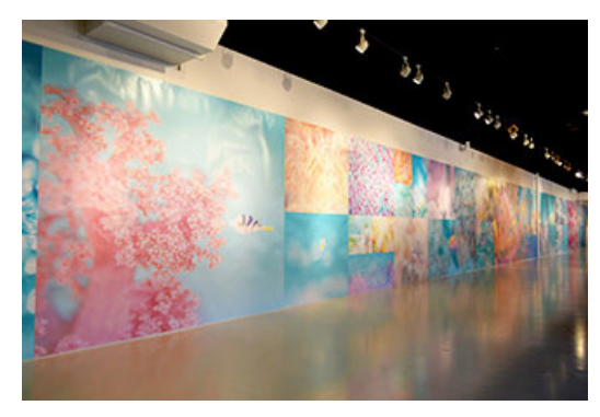
Sachi Murai Photo Exhibition - FantaSea