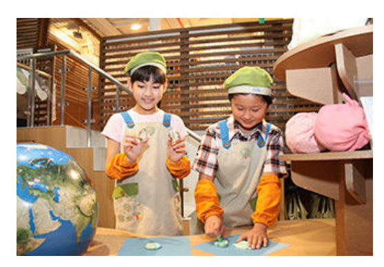
Children making soap from recycled materials

on the tasks of planning a new product that uses euglena to solve problems in the world and then proposing sales promotion strategy for the product. They gave presentations to senior employees in a business meeting room. All the teams came up with wonderfully individualistic and inventive proposals as good as any adult could produce. The children achieved significant personal development over the two days as young business persons of sogo shosha . At KidZania Tokyo, a popular venue for children, we will continue to provide them with opportunities to enjoy learning environmental preservation from a global perspective, offer a range of events for children, and help develop young people who will be leaders of sustainable society.