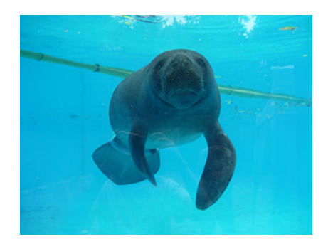
The Amazon manatee is an endangered species