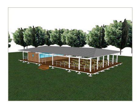
Visitor center in the Field Museum (conceptual rendering)