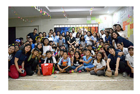
At the Christmas Party