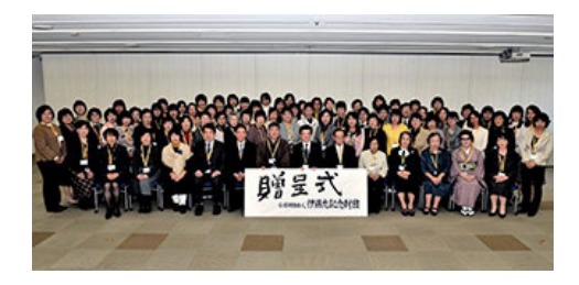
The ITOCHU Foundation holds a presentation ceremony once a year for subsidizing the development of children's literature collections