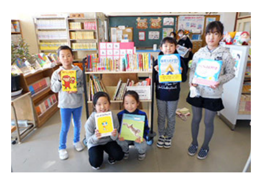
Children of Onagawa Elementary School, to which books were donated

damaged by the Great East Japan Earthquake.