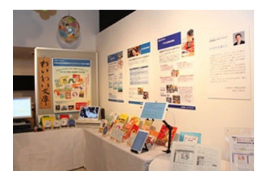
The Power of Children's Books Exhibition that Her Imperial Majesty the Empress of Japan visited (Display of Multimedia Daisy books in 2014)