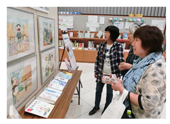
Exhibition of illustrations of Nukada no tassai at Ibaraki Prefectural Library