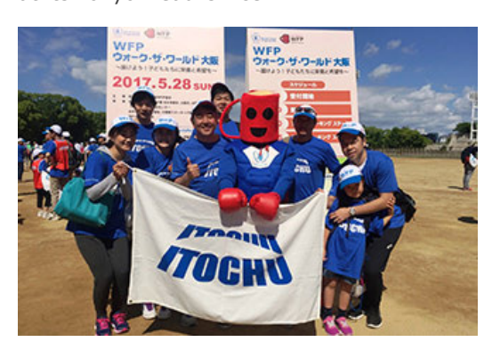
Participated in End Hunger: Walk the World held in Yokohama (left) and Osaka (right)