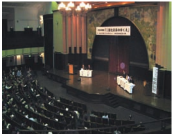
A seminar open to the general public

organize Summer School Programs on the Environment every year mainly for elementary school students in Minato-ku, the location of our Tokyo Head Office.