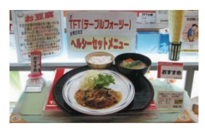
Table for Two menu

ITOCHU established the ITOCHU FOUNDATION in 1974 to foster youths of sound body and mind. The Foundation mainly supports educational reading programs for children conducted by volunteers in many areas, manages the Center for Tokyo Elementary and Junior High School Students—said to be the first of its kind in the private sector—and organizes camping activities that emphasize interaction among different age groups. Continued over many years, those efforts have earned approval from society.