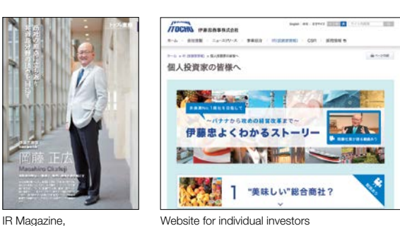
IR Magazine, Summer 2014