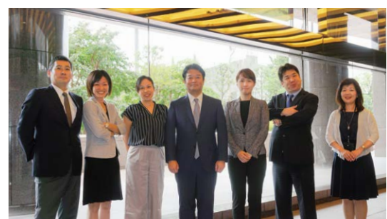
IR Department members (July 2017)