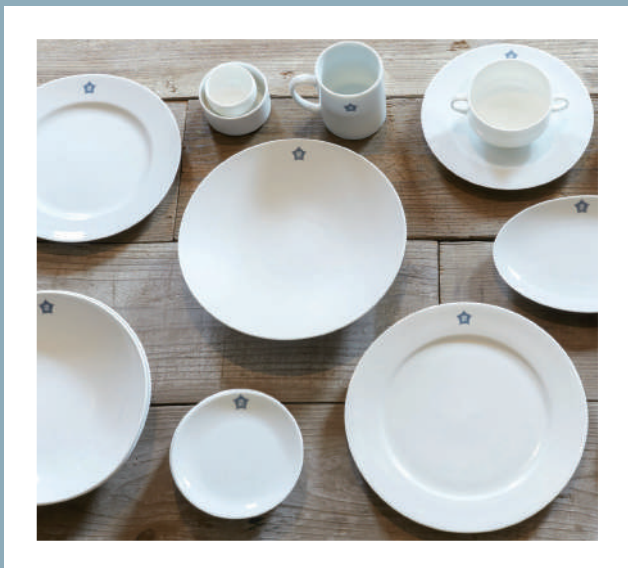
Tableware Second-hand commercial tableware is mainly used. We carefully select those potential from miscellaneous items, re-design and use them effectively while concerning of reduction on environmental burden.