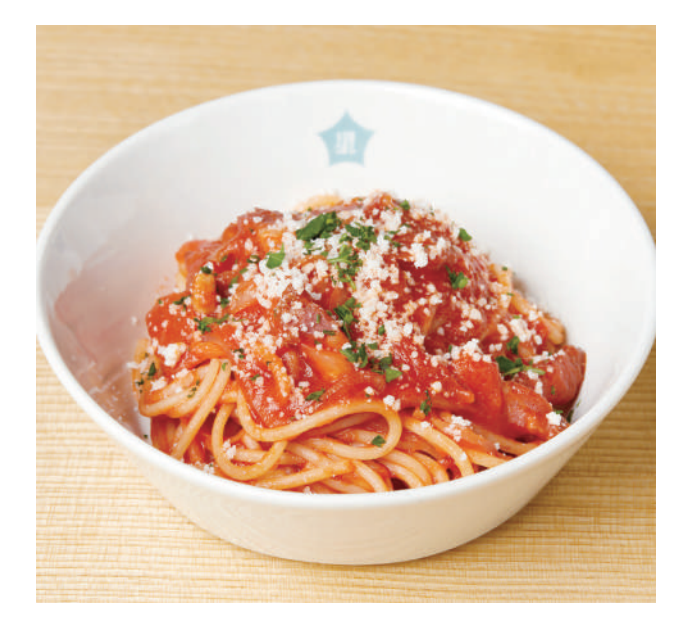
Kids Bacon & Tomato Spaghetti (wheat) 900

free-range egg omelette rice, soynugget, shrimp tempura (w/tartar sauce), french fries(domestic potato), vegetables(domestic, local)