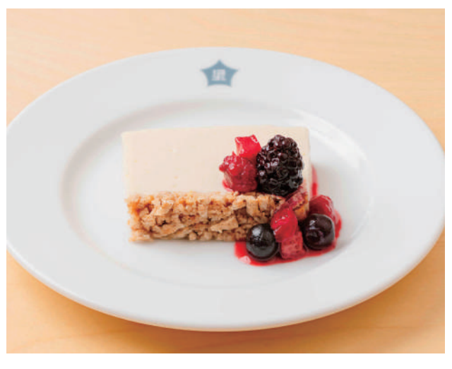
No Bake Soy Cheesecake (wheat) 600 cheese-flavored soy cream, organic sugar, soymilk, soy butter

free-range egg, soymilk, organic flour, soy butter, seasonal fruits