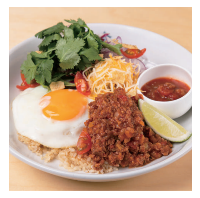
Soymeat & Coriander Taco Rice, 1700 Organic Cheese & Free-range Egg (egg, milk)

free-range egg, organic rice, "Fukumidori" chicken(free-range), organic ketchup, grapeseed oil