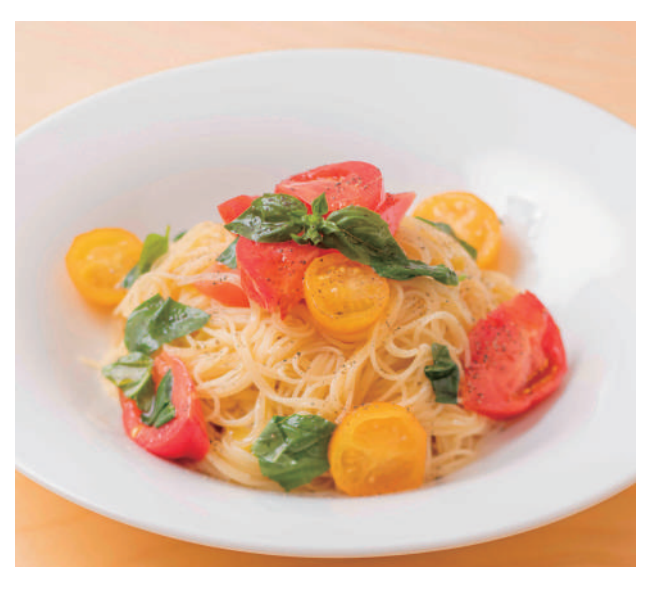
Chilled Cherry Tomato Pasta (wheat) vegetables (domestic, local, etc.), organic olive oil, organic black peppers

domestic flours, soy cheese, organic canned whole tomaotes